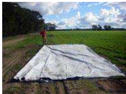
Fold in Half