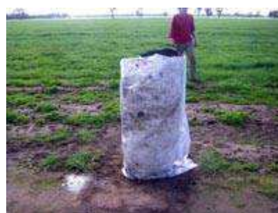
25kg section in liner

Twine liners are the same size as the "Silage Wrap Only" liners, but have red writing on them and are clearly labelled "Twine only". No other plastics should be put in these liners or they will be rejected at the drop off sites.