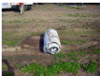
Rolled up silage pit cover