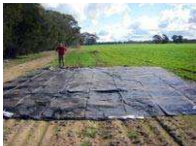
10m section of Silage pit cover

The method outlined below maximises the amount you can get into a liner. It is important to ensure loose silage has been shaken off the cover before folding. A pit cover section of up to 10m x 15m will fit in one Plasback liner once properly folded and rolled. See below..