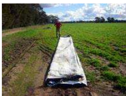
Fold in Half Again