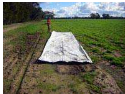
Fold in Half Again