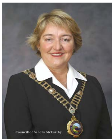
Mayor Sandra McCarthy