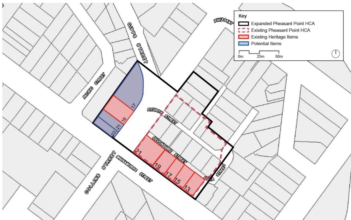
Proposed and Existing Boundaries of the Pheasants Point HCA.

There is currently one listed group of heritage items located within the existing Pheasant Point HCA (I125). The proposed Expanded Pheasant Point HCA would incorporate this item as well as one additional listed item within its boundaries. An additional two potential items from the shortlist are located within the boundaries of the Extended Pheasant Point HCA, with one of these properties a potential individual item.