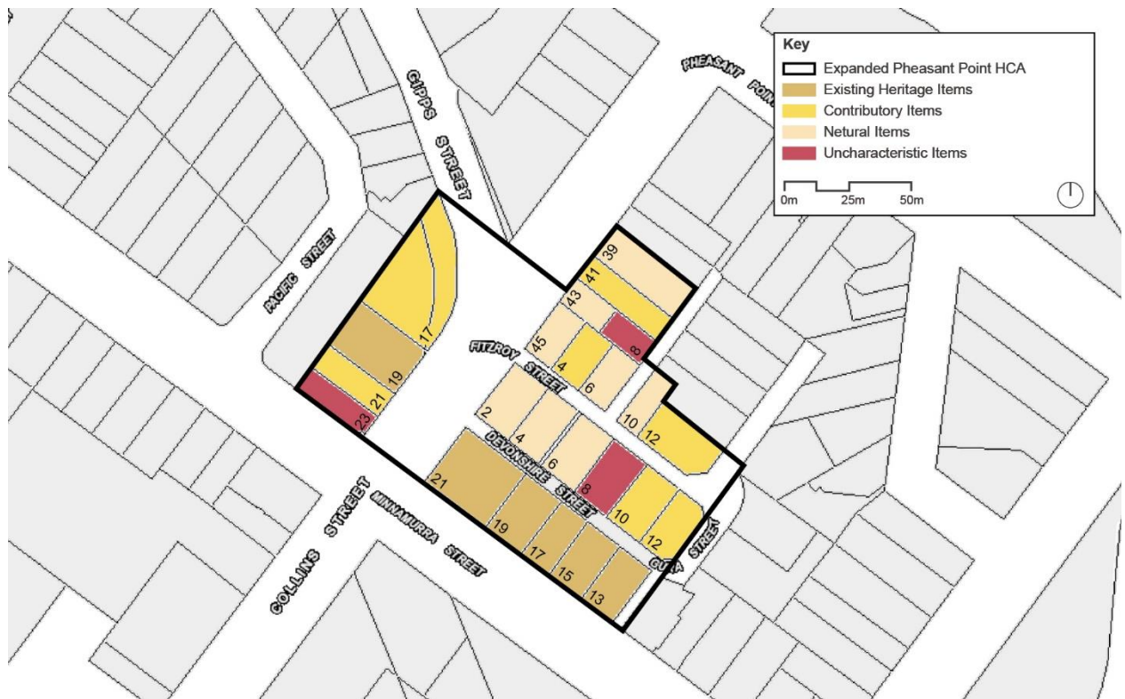
Classification of buildings within the Pheasant Point HCA.

A number of the properties within the Pheasant Point HCA are listed as individual heritage items in Schedule 5 of the Kiama LEP 2011. Other buildings are classified as contributory, neutral or uncharacteristic. The classification of each individual building is indicated on the map below and in the following table: