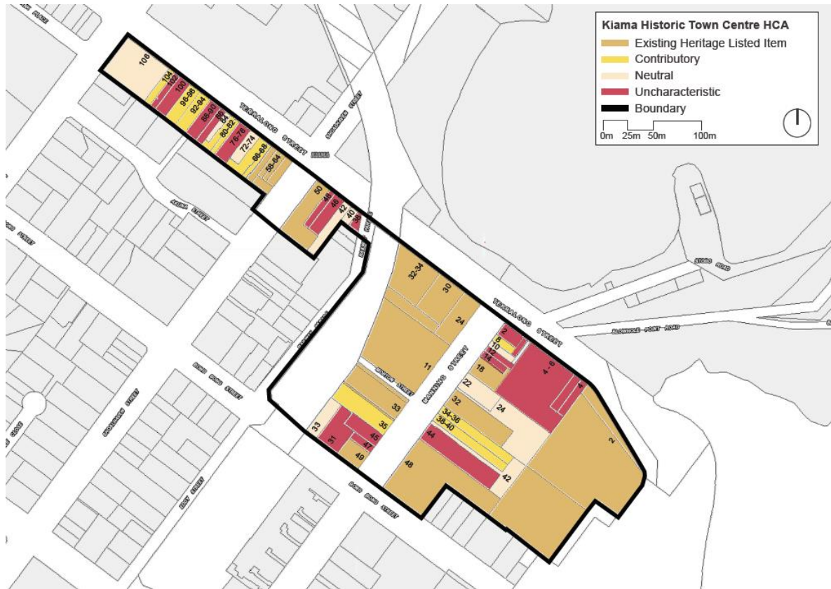
Classification of buildings within the Kiama Historic Town Centre HCA.

A number of the properties within the Kiama Historic Town Centre HCA are listed as individual heritage items in Schedule 5 of the Kiama LEP 2011. Other buildings are classified as contributory, neutral or uncharacteristic. The classification of each individual building is indicated on the map below and in the following table: