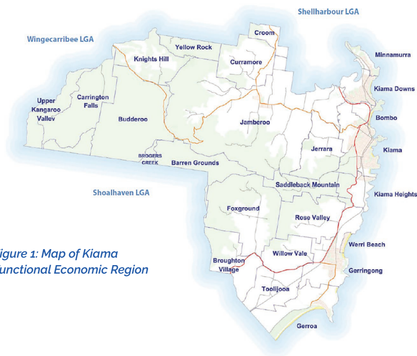
Figure 1: Map of Kiama Functional Economic Region

People who work in Kiama typically live in the Region with 66% of local jobs held by residents. However, 57% of the employed labour force residing in the Region commute to a work location outside the Region. Kiama is highly connected to the Wollongong and Shoalhaven labour markets.