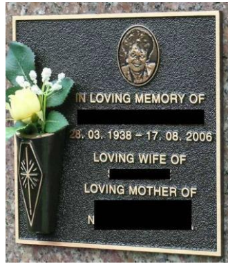
Figure Two: Example of a Kiama Cemetery Memorial Garden Wall plaque